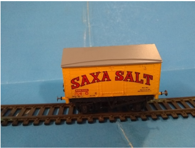
Paul Lessard's 1/76th British salt car from Slater's.