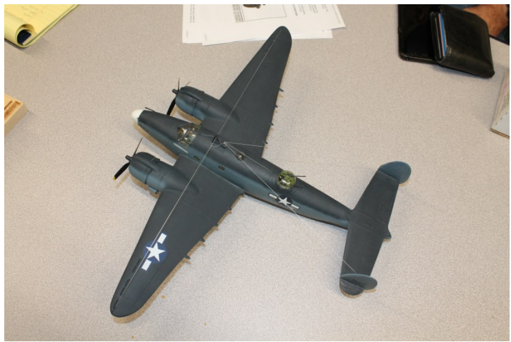
Rich Filteau built this 1/48 vacuform Lockheed PV-1 Ventura from Koster Aero Enterprises.