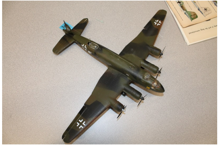
Chuck Converse's 1/72 nd Revell Fw-200 Condor. He replaced the oversized guns and added a dorsal gunner.