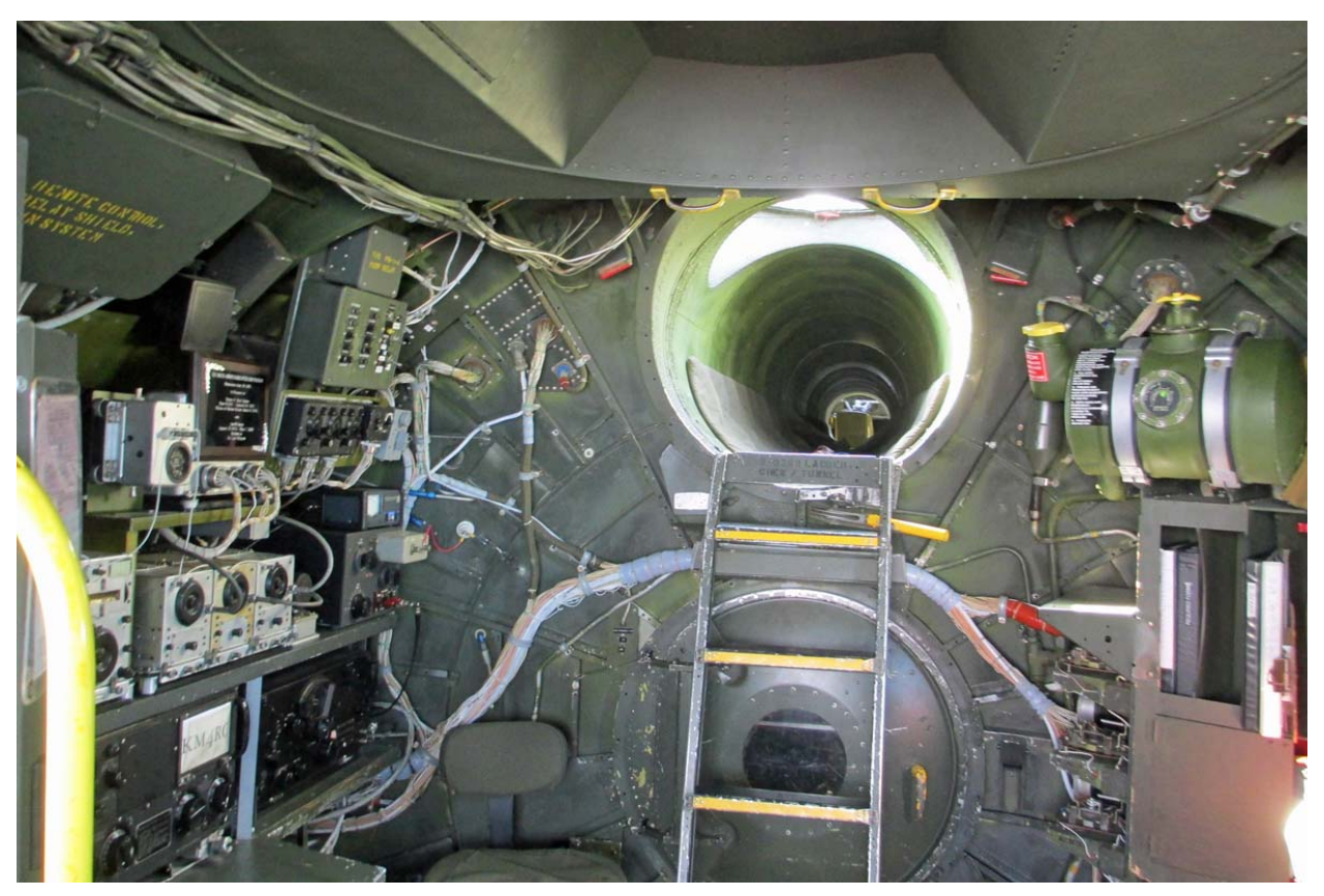
Note the lower hatch, seen in center of the pressure bulkhead. It gives access to the bomb bay, not often used in flight.

The internet came to the rescue with some suggested answers. This photo shows the interior of flight deck of CAF's famed B-29 "Fifi", looking aft.