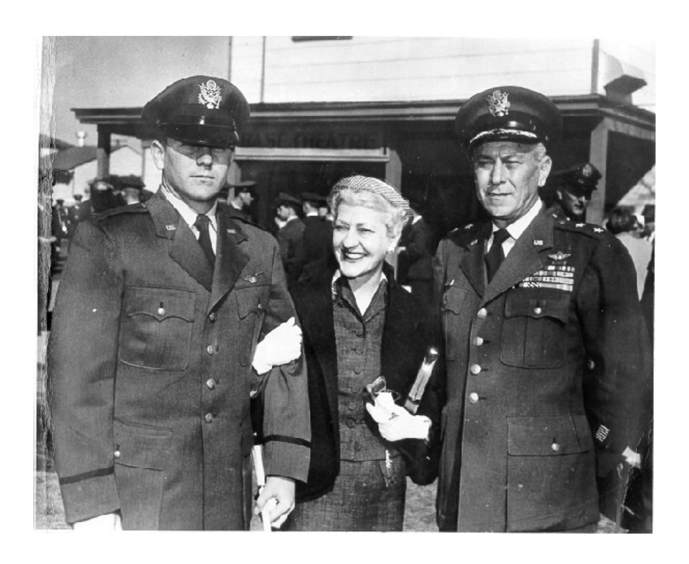
That fighter pilot is seen here as a major.