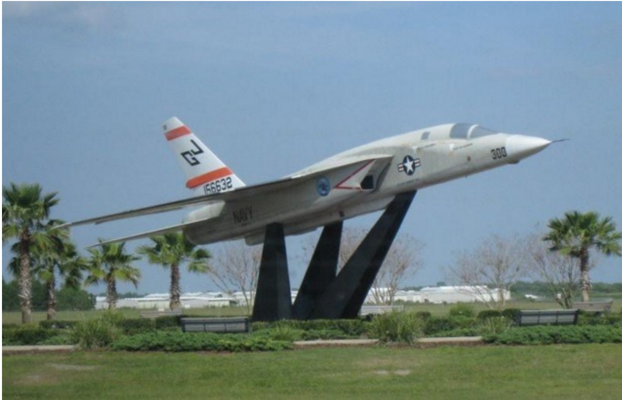
"Gate Guard" RA-5C at Orlando-Sanford Int'l Airport, the former Sanford NAS

When the naval station was closed in 1968, the local community refashioned their windfall of long jet runways into an international airport, renaming it ORLANDO-Sanford International to better identify it with central Florida tourist attractions. It offers leisure travellers (to Disney, etc.) an often-cheaper and less congested travel alternative to Orlando International. For example, this article aimed at BRITISH tourists notes why Sanford is a better destination for their nine-hour flights direct from England to visit central Florida attractions .... resorts like Disney World (aka "The Mouse House"). http://orlandoinformer.com/blog/why-brits-must-fly-into-sanford-international-airport/