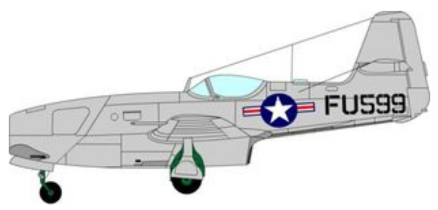
The only Yak-23 ever seen in U.S. markings. Tested secretly in 1953 at Wright Patterson AFB, it was then returned to the Yugoslavs who had loaned the Romanian-defected fighter <u>https://en.wikipedia.org/wiki/Yakovlev_Yak-23</u>

This month Jim besides books, Jim has included in-box kit reviews, one of them the Special Hobby 1/72nd Yak-23 "Flora" jet fighter. The name is its NATO-assigned identification code, like "Fagot" for MiG-15 and "Fitter" for Sukhoi Su-7. This Yak-23 had been a natural progression of earlier Yak jet fighters which started with straightforward conversions of WWII piston engine fighters with a captured German Jumo jet engine hung where the piston engine had been and exhausting under the wing. Later designs like the Yak–23 were propelled by jet engines derived from Rolls Royce designs which had thoughtfully provided to the Russkies by the British in Clement Atlee's socialist Labor Government. The latter did NOT collect any license fees for their largess, other than the pleasure of meeting those unpaid-for copies, installed in MiG's, high over the Yalu River in Korea. See <u>https://en.wikipedia.org/wiki/Klimov_VK-1</u>