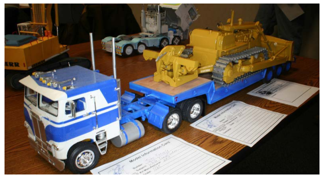
John Frevele White Freightliner AMT 1/25, Cowboy drop deck lowered trailer AMT 1/25, Caterpiller Bulldozer 08H AMT 1/25