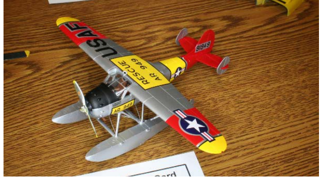
Paul Boyer Cessna LC-126A Lift here! Models 1/72