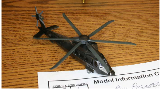
Phil Pignataro Stealth Helicopter Dragon 1/144