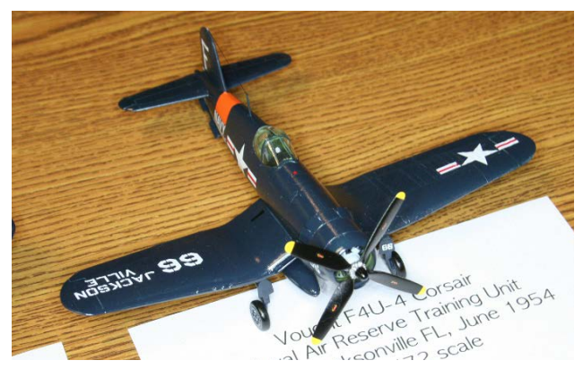
Art Giovannoni F4U-4 Corsair Revell 1/72