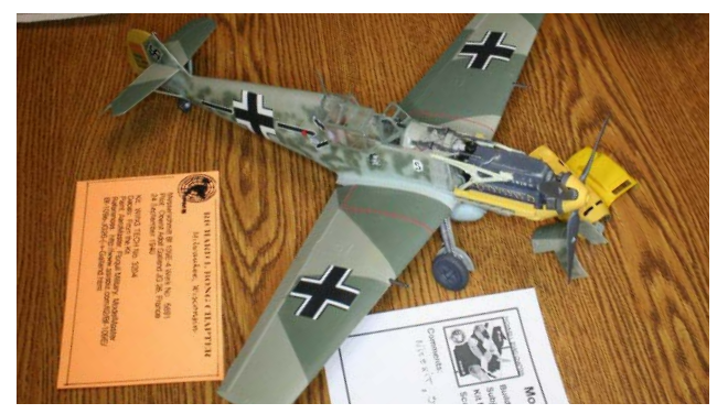
Al Jones Bf-109E-4 Wing Tech 1/32