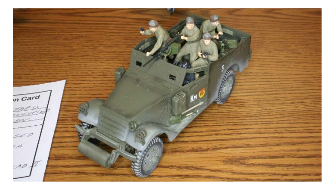
Jim Zeske M3 A1 Scout Car Tamiya 1/35