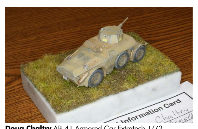
Doug Chaltry AB-41 Armored Car Extratech 1/72,