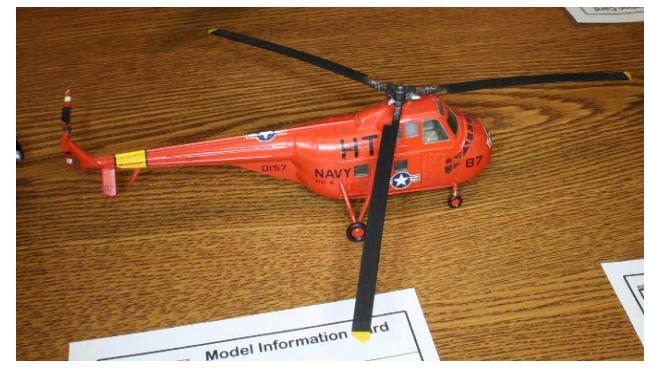
Paul Boyer Sikorsky HO4S Airfix 1/72