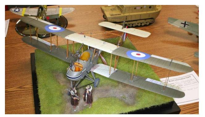
Phil Kirchmeier FE.2B Wingnut Wings 1/32