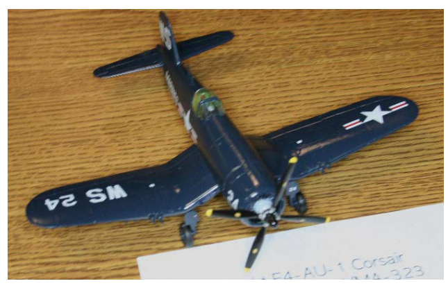
Art Giovannoni F4-AU-1 Corsair Italeri 1/72