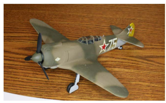
Doug Chaltry La-5 Super Model 1/72