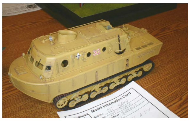
Pat Hahn Wasser Schlepper Hobby Boss 1/35