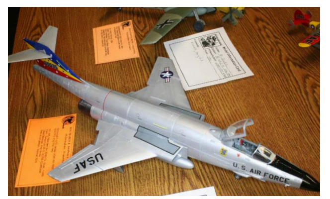
Al Jones F-101C Voodoo Kittyhawk 1/48