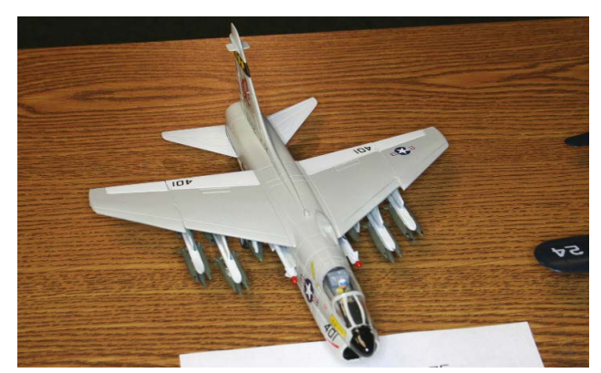
Art Giovannoni A-7E Corsair Matchbox 1/72