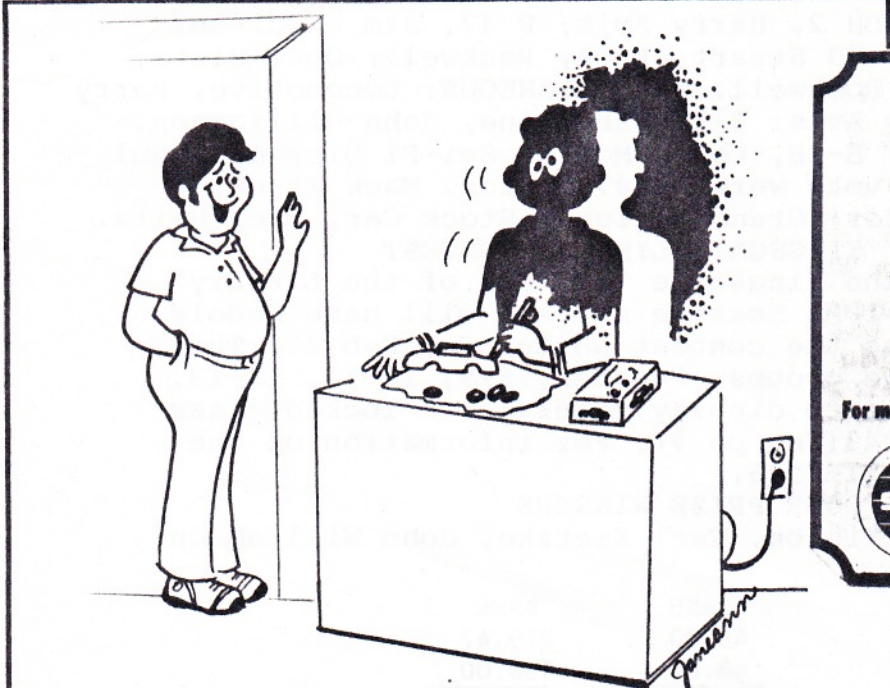
"Still having trouble with your airbrush?"