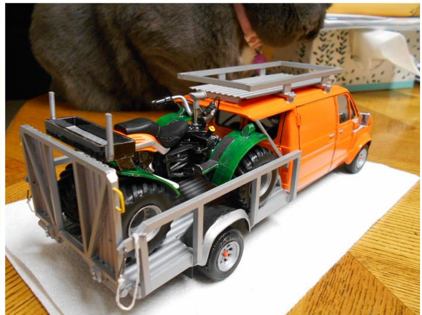
The 'Green hornet' goes back to