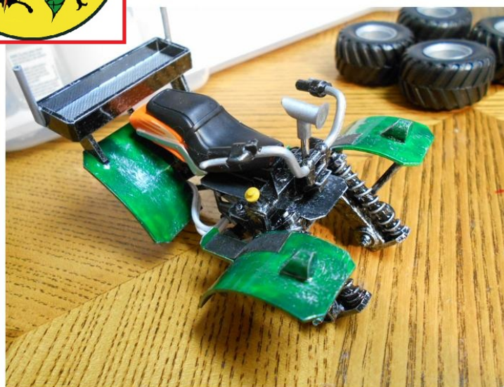
The ' Green Hornet'....almost done...