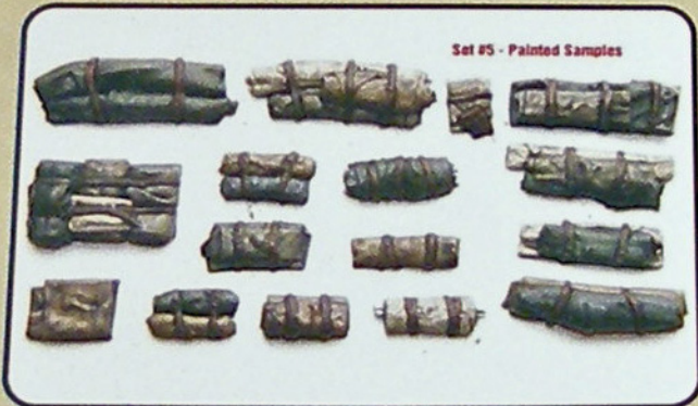
Generic/Universal Tents & Tarps Set #5

Cleaning/Degreasing: All resin bits should be cleaned with washing up liquid, glass cleaner or alcohol before painting to remove any mold release or oils for best adhesion of glue and paint. We not use any mold release.